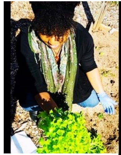
Healthy Communities staff harvesting produce from the Forsyth Public Health Department Community Garden to provide fresh produce to East Winston Community

Through the Arts Event" which consisted of the creation of murals for participating healthy corner stores not only as a way to market the businesses but also to beautify